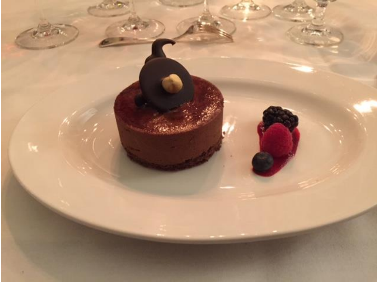
Chocolate Hazelnut Praline with three berries