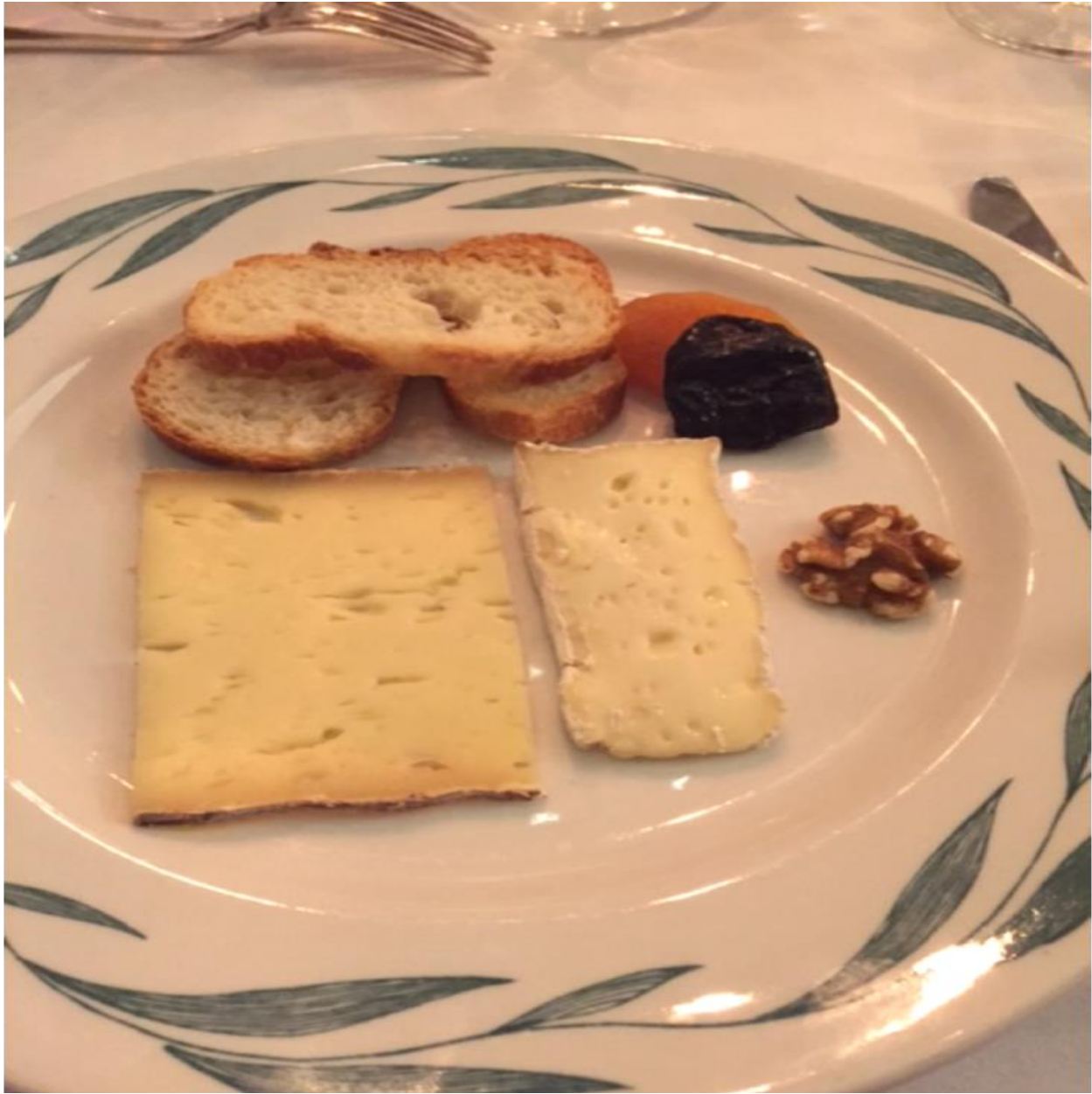
Cheese from Normandy and the Pyrenees also paired well with Red Bordeaux wines