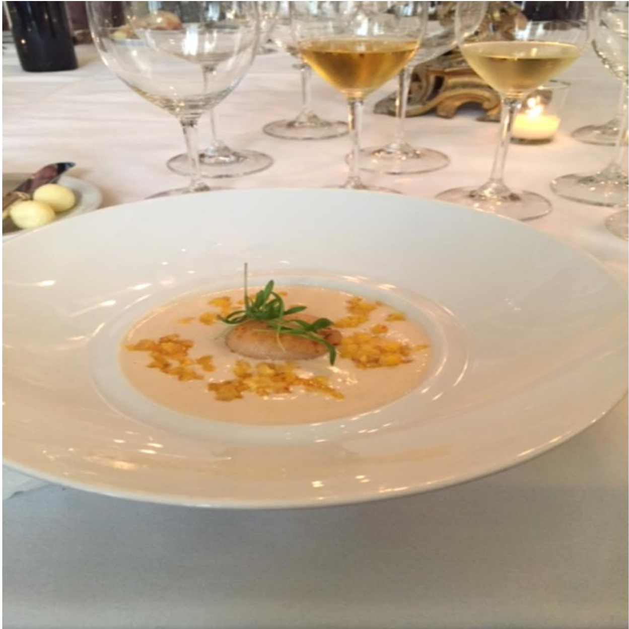
Cauliflower Veloute, Seared Scallop—a beautiful foyle for the richness of white Burgundy