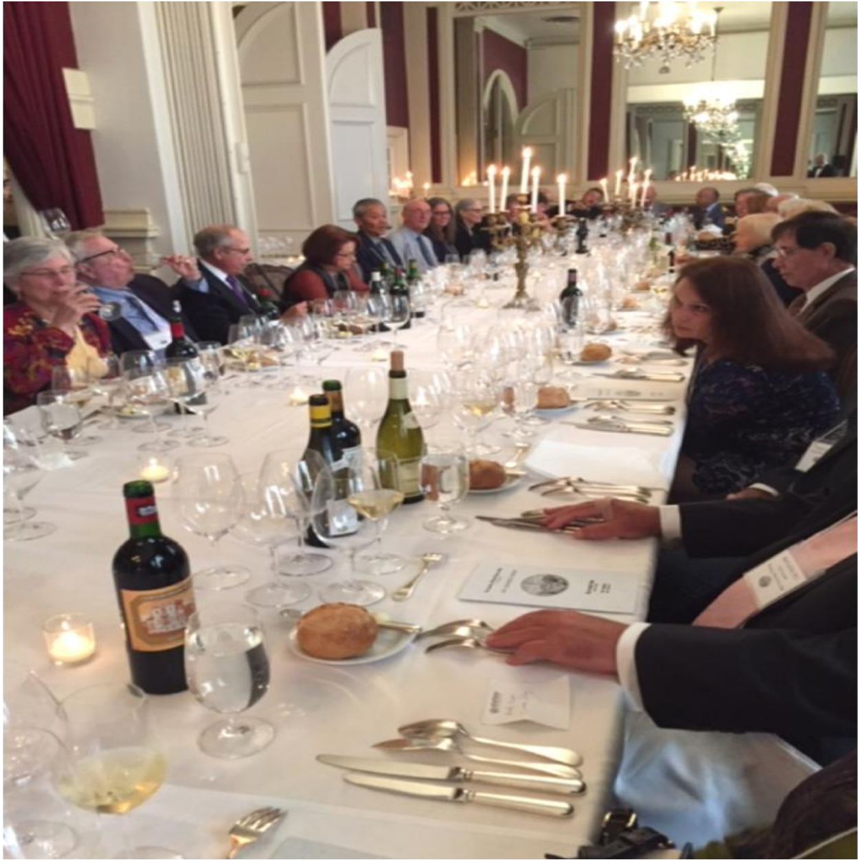
The lovely table at the French Club with members and guests and their bottles awaiting the first course