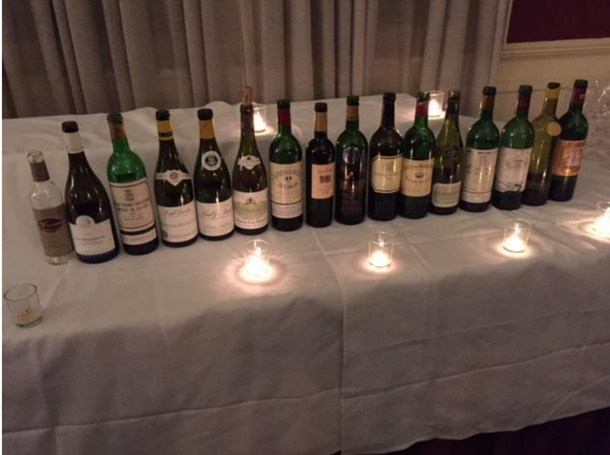
At the end of the evening, a line-up of some of the warriors who gave their all