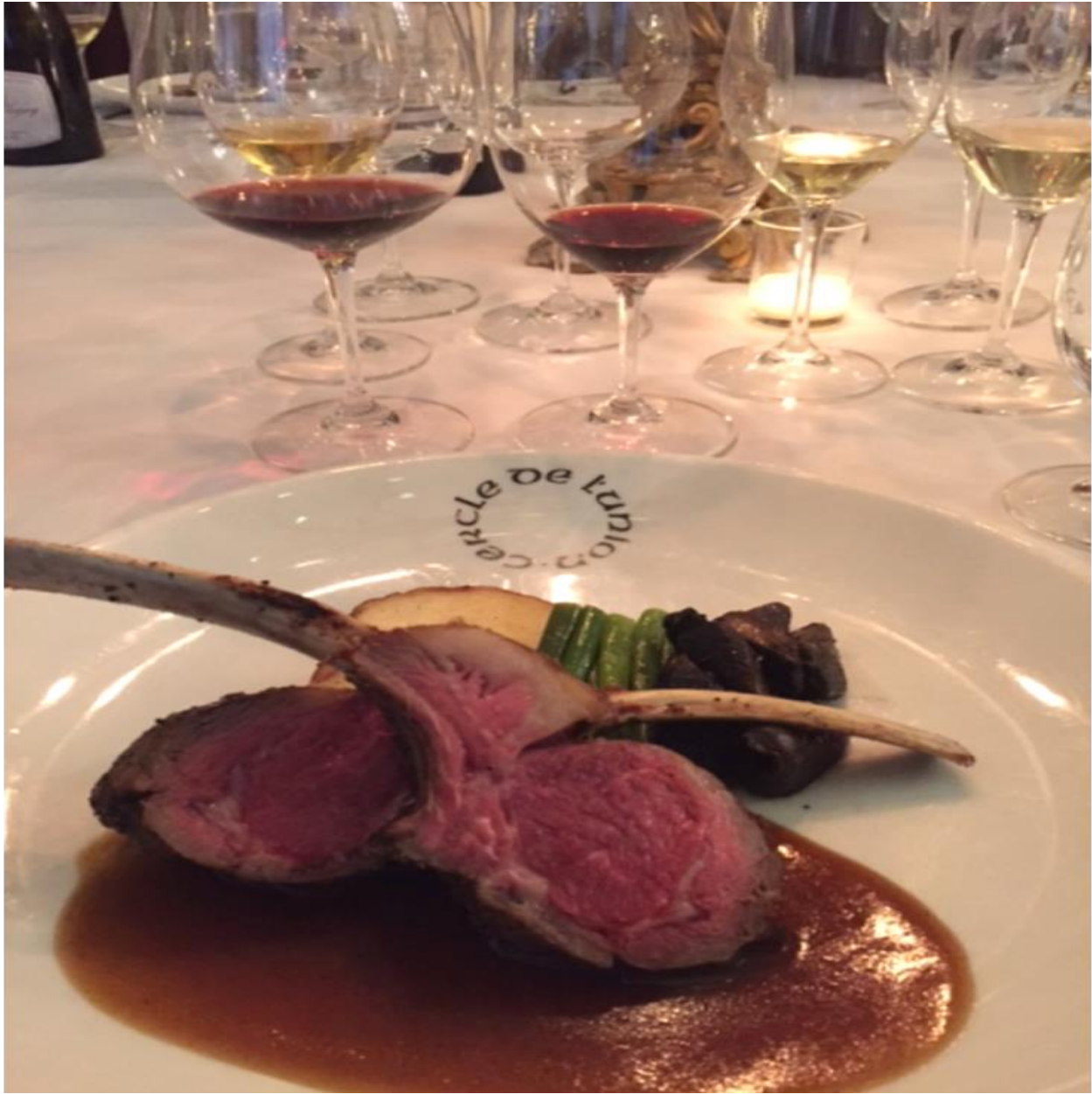
Rack of Lamb, Bordelaise Sauce, paired well with bottles of young and old Bordeaux