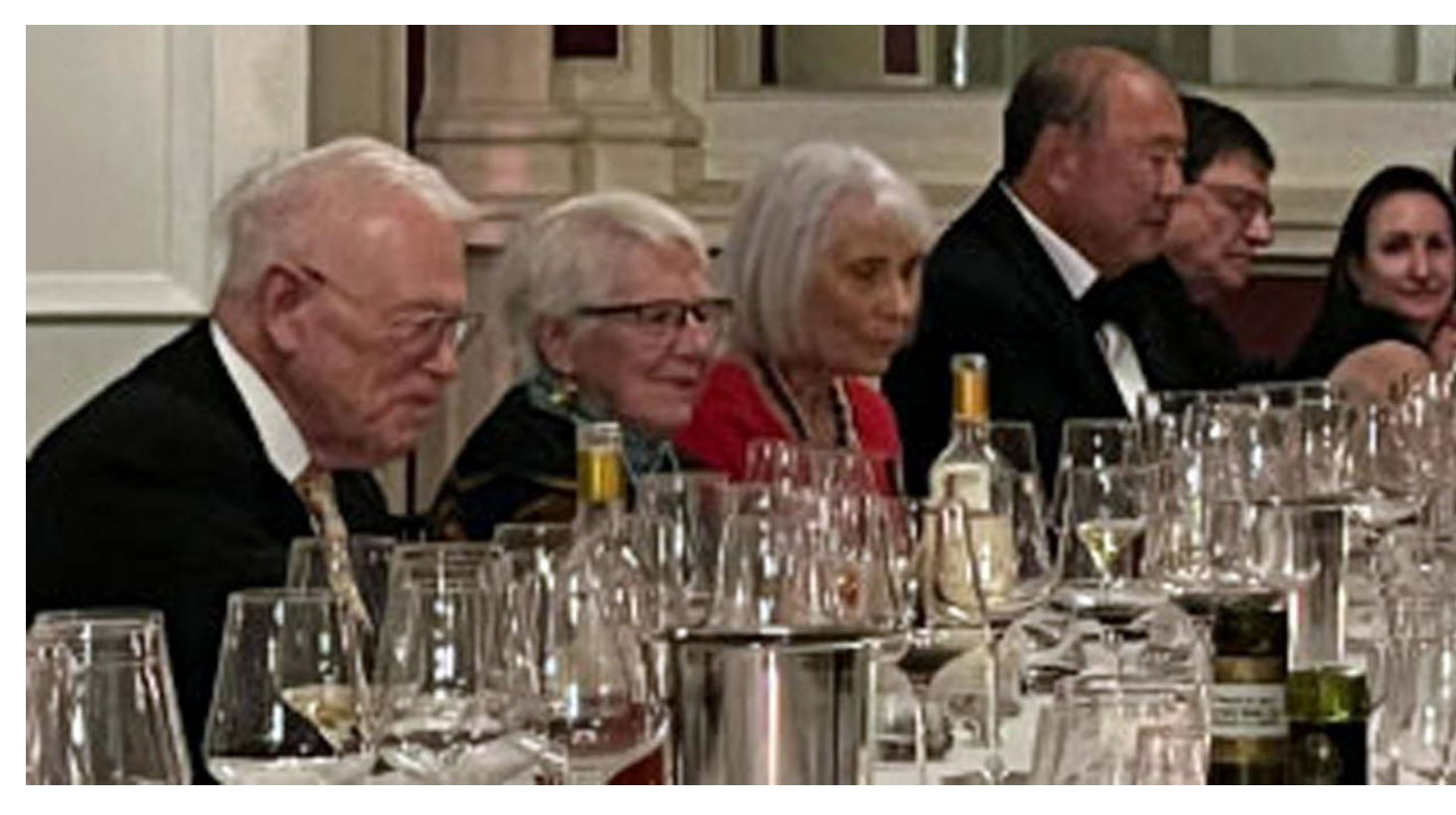
Enjoying Dinner amidst a plethora of glasses