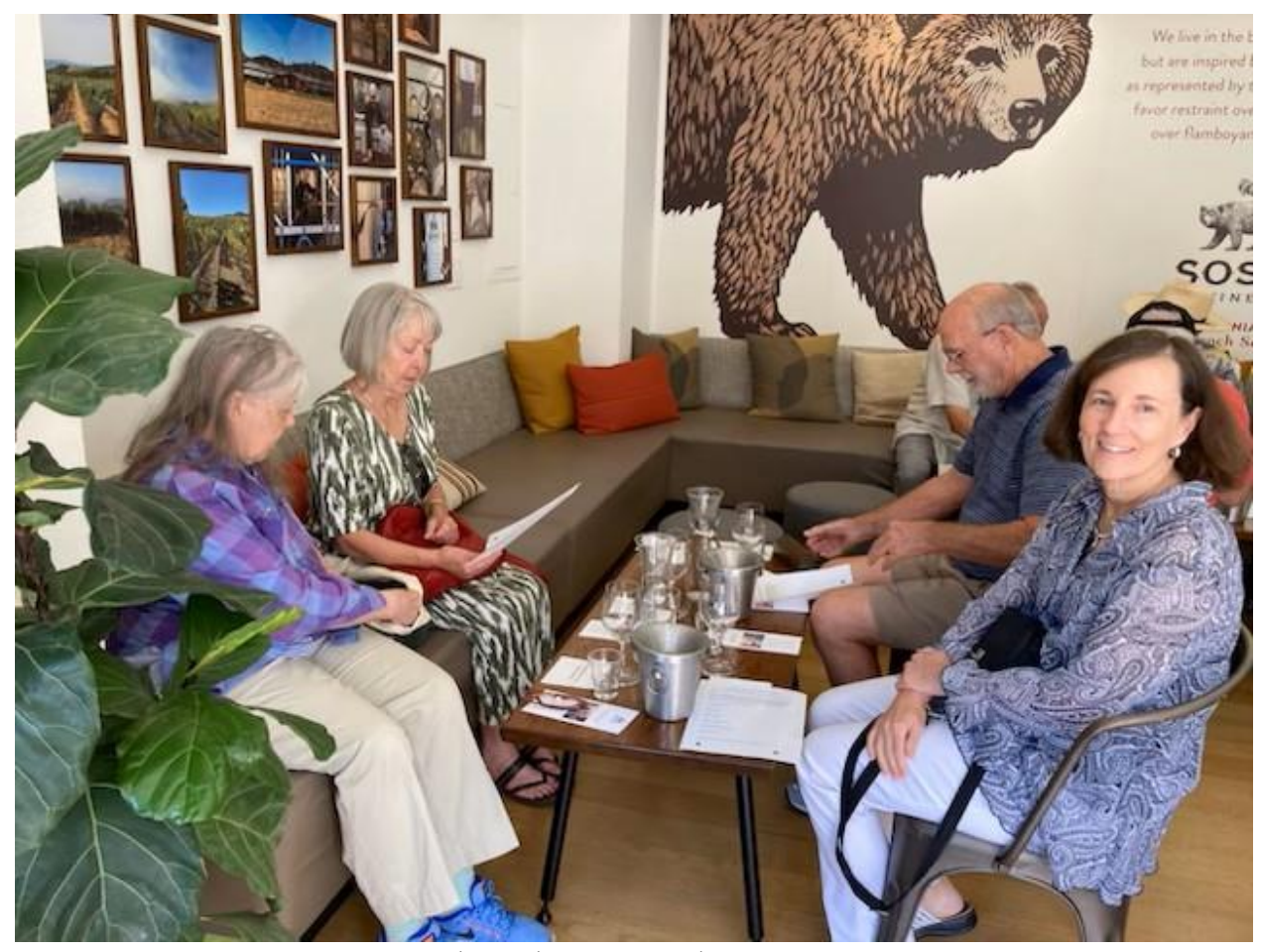
SMFW Members and guest enjoying the presentation at Sosie